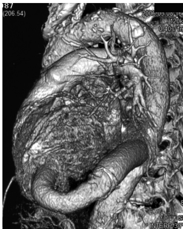
Fig. 2. Postoperative computed tomography after AAVC insertion demonstrated unobstructed conduit.

Although AAVC can be performed off-pump with recent modification [6], the most commonly used method for AAVC